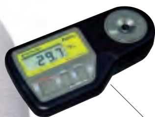
PR-32 \alpha Cat.No.3405

Four models of the Palette \alpha are available for your different measurement samples.