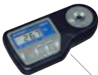
PR-101 \alpha Cat.No.3442