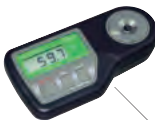
PR-201 \alpha Cat.No.3452