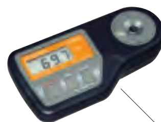
PR-301 \alpha Cat.No.3462