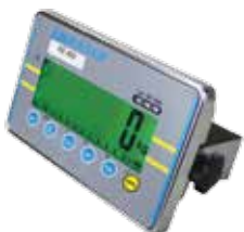
AE 402 Indicator