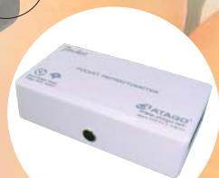
Convenient storage case

* External Light Interference (ELI) - Patent Pending When intense light penetrates the prism of a digital refractometer, the light waves interfere with the sensor resulting in inaccurate readings. The PAL series is equipped with ELI technology, which will display the warning message "nnn" if the ambient light is too intense. If the warning message is displayed, simply turn away from the light source or shade the prism with your hand and press the START key again.