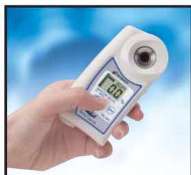
② Press the START key.