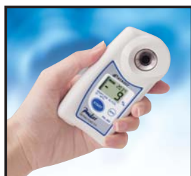
④ *Secondary Scale: Press the START key for 2 seconds while the concentration (%) is indicated, to display the freezing point (°C/°F).