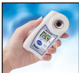
③ The measurement value will be displayed in 3 seconds.