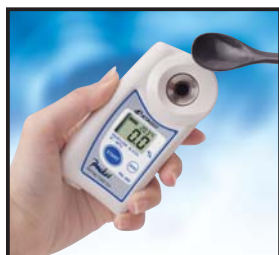
① Place the sample onto the prism surface.