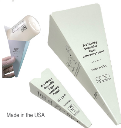
Made in the USA

Eco-smartFunnels funnels are widely used in sample collection tasks such as sputum collection for Covid-19 testing.