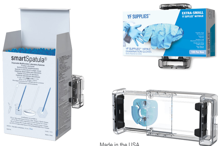
Made in the USA

The LevGo universal, rotating, and expanding Dispensing Box Holder, is the ONLY holder that easily expands from 95 to 155 mm (3.75 to 6 inches) to hold a variety of dispensing boxes, containers and small electronics (power cord pass-through port built-in).