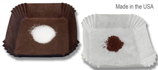
Made in the USA

The LevGo Paper Weighing Boat is easier to handle than weighing paper and is a simple, cost-effective solution to reduce plastic use in the lab. Made of grease proof FSC® Mix Paper that meets FDA 21 CFR 176.170 (components of paper in contact with aqueous and fatty foods) and with 21 CFR 176.180 (contact with dry foods). Compatible with heat applications with a temperature limitation of 210 °C. The LevGo Paper Weighing Boat is available in both brown for light colored samples and white for dark samples. Our medium sized boats are made in the USA.