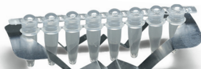
Made in the USA