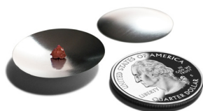
Made in the USA

The LevGo "Cahn style" micro balance accessory pan weighs just ~53 mg, is compatible with most commercially available analyzers and microbalances, and is ideal for organic, micro elementary, and thermal analysis, and for pharmaceutical applications.